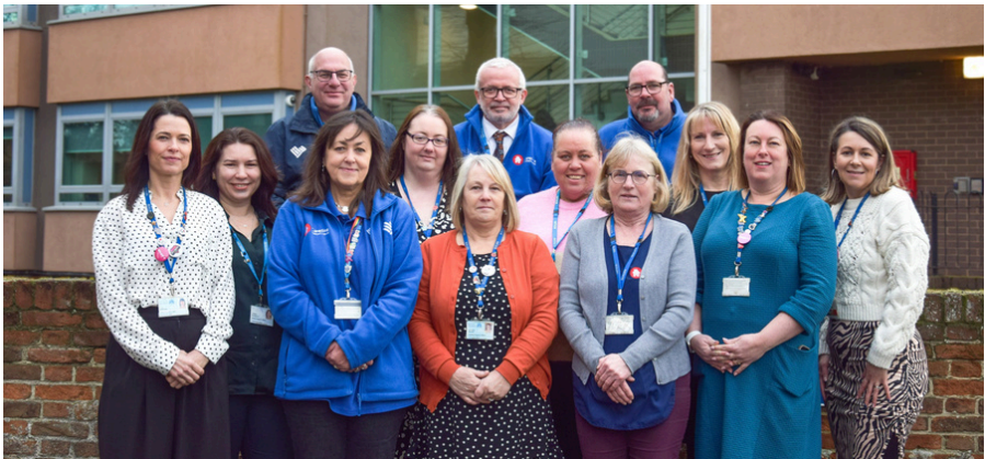
The Careline Community Service team.

*alarms are charged up to the end of the month in which the equipment is returned