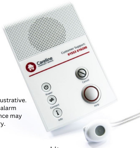
Photo is illustrative. Actual alarm appearance may vary.

Independence when you want it, help when you need it.